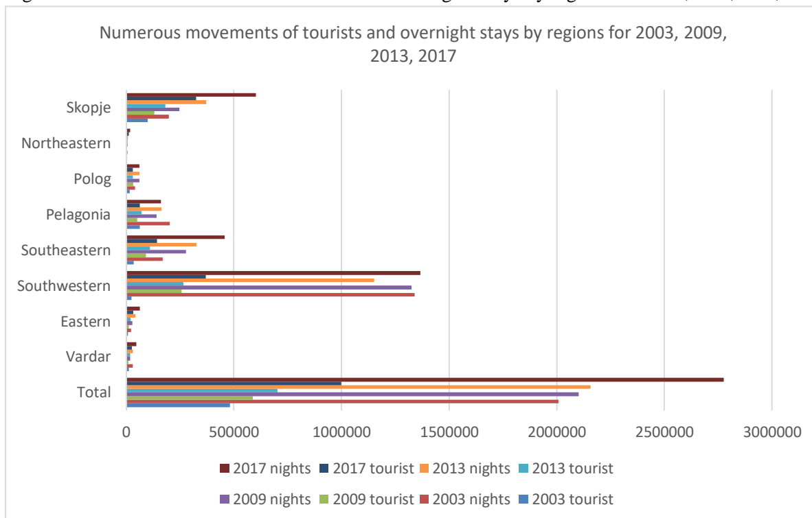
Figure 1. Numerous movements of tourists and overnights stays by regions for 2003,2009,2013,2017

Interesting is the data about the number of hotels for a period of one century, so from 24 hotels and hostels in 1912, [11] [12] their number after the First World War has steadily increased, from 160 hotels and lodging in 1936, [13] 300 hotels, motels and resorts in 1989 [14], then 486 hotels, hostels, motels and resorts in 2008 [14] [15]